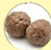
Meatball (bò viên)