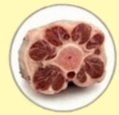
Oxtail (đuôi bò)

Please inform your server of any food allergies or dietary restrictions. All entrees made to order, no return or exchanges. Gratuity will be added to any parties.